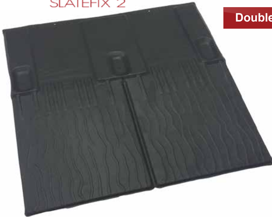
Double Slate Panel